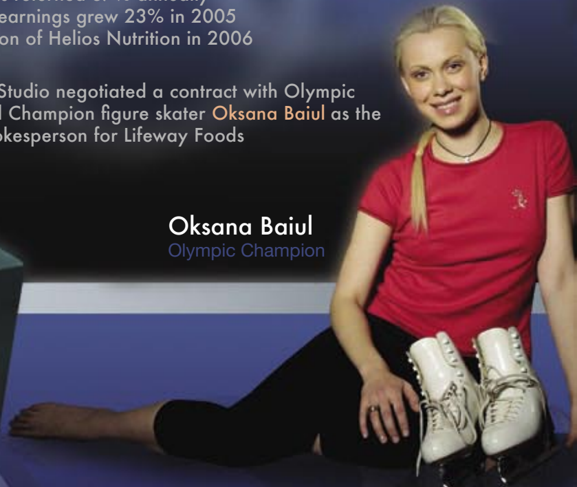
Oksana Baiul Olympic Champion

I Imagine Studio negotiated a contract with Olympic and World Champion figure skater Oksana Baiul as the official spokesperson for Lifeway Foods